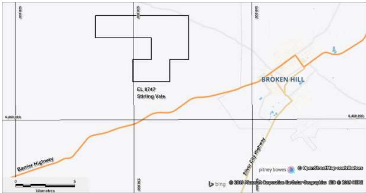
Figure 1: EL8747 showing location relative to Broken Hill