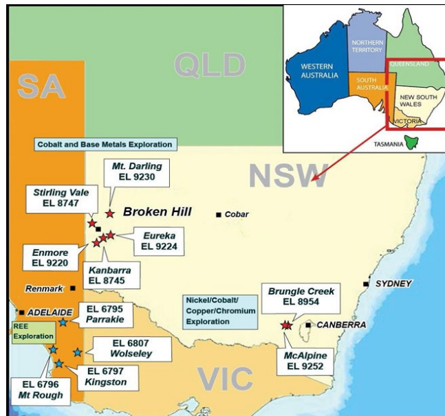
Figure 1: Ausmon Resources NSW and SA Projects