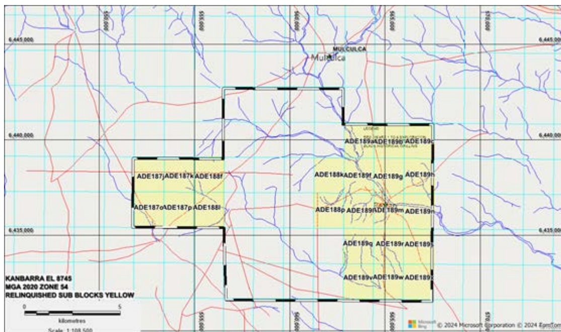
Figure 1: EL8745 showing the relinquished portions in yellow